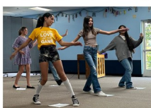
A group of middle school students perform at the Spanish Heritage assembly on October 6th, 2023.