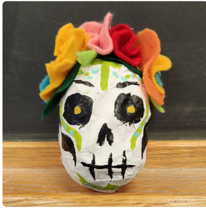
Paper Mache Skulls for Dia de los Muertos!