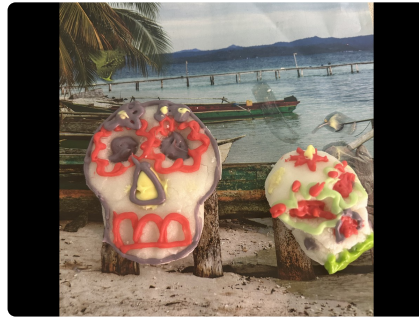
7th and 8th made sugar skulls for the Day of the Dead "El dia de los muertos".