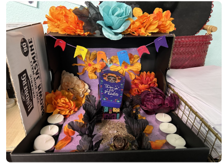
Altars from 4th and 5th graders