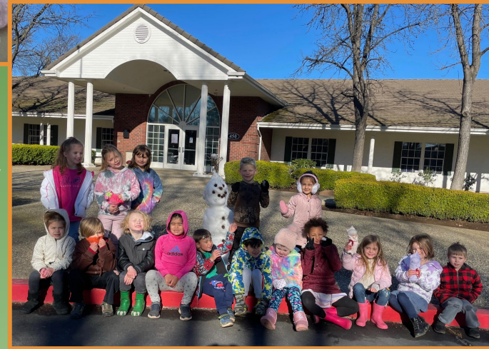
"Field Trip" to the snow