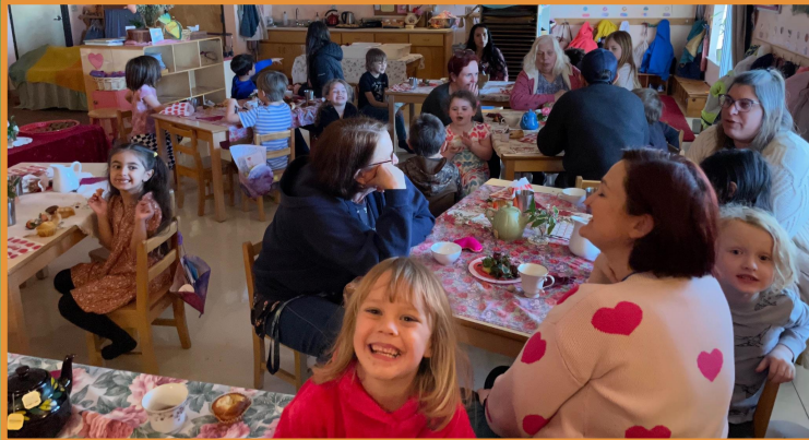
Valentine Tea Party