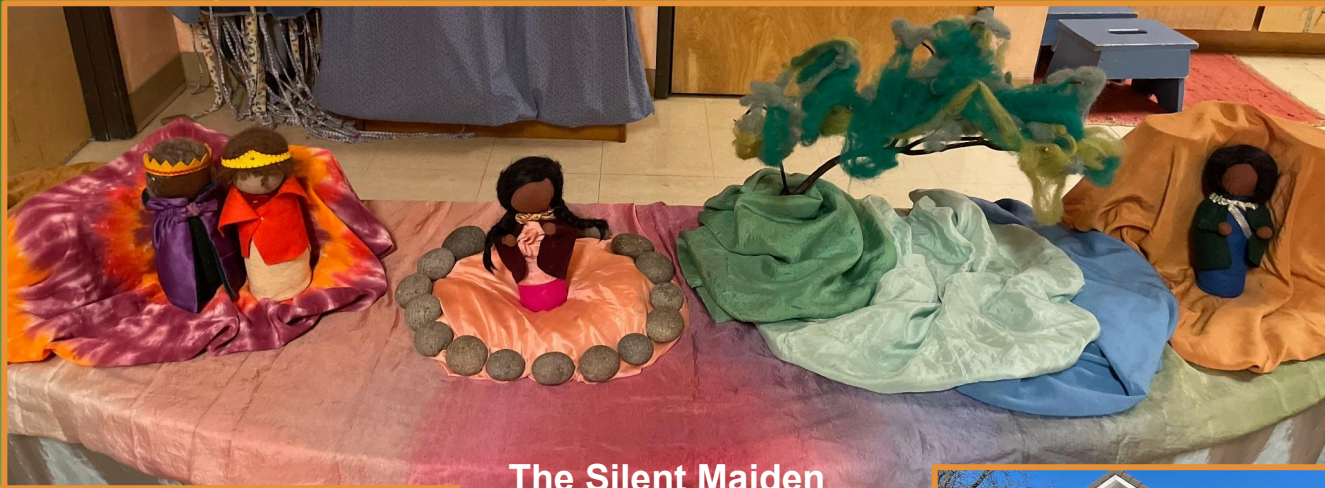
The Silent Maiden