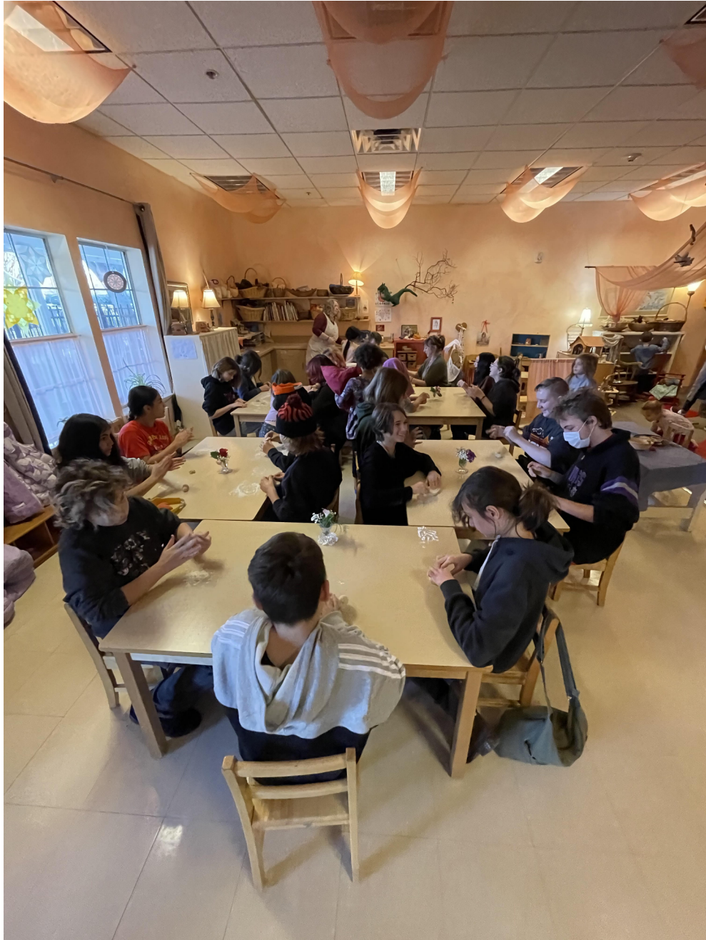
7th-grade visiting Kindergarten